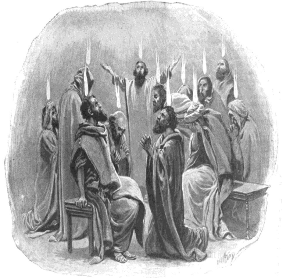
“There appeared unto them cloven tongues like as of fire.”—Acts ii. 3.