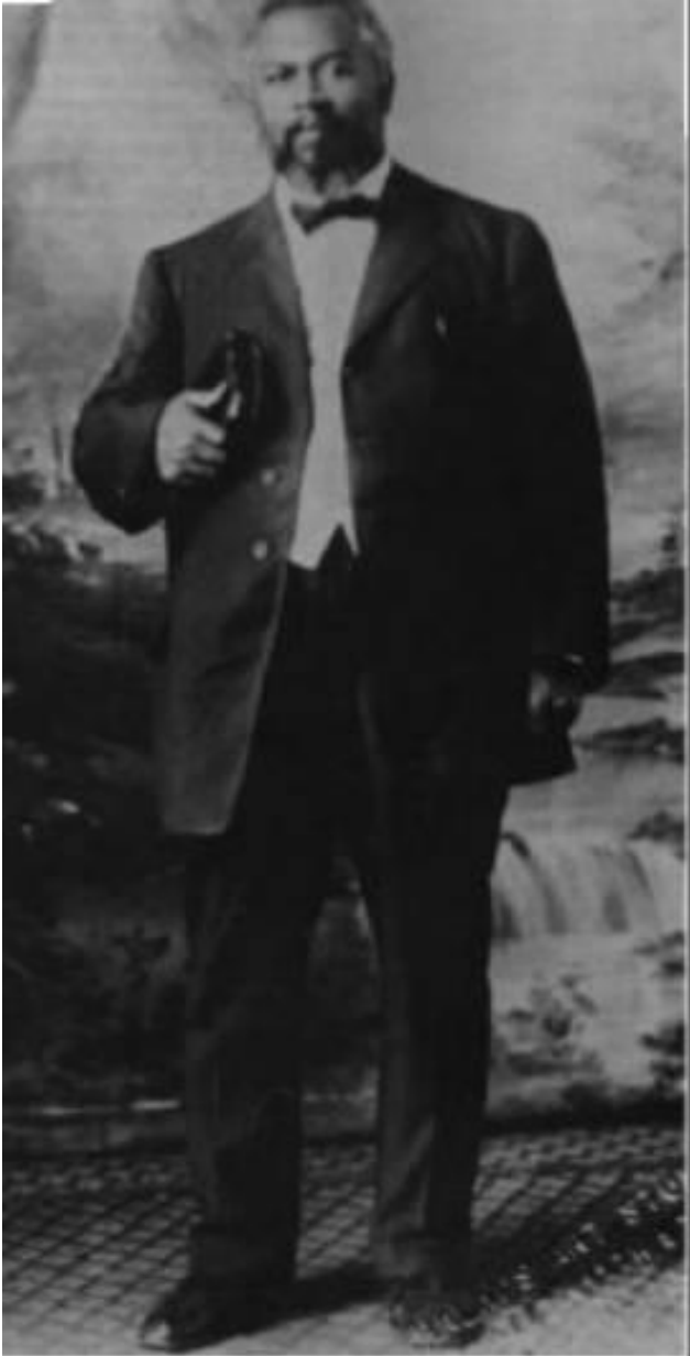
▶ William Seymour (1870-1922) Azusa street Revival