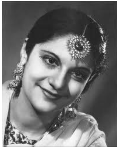
First miss India in 1947